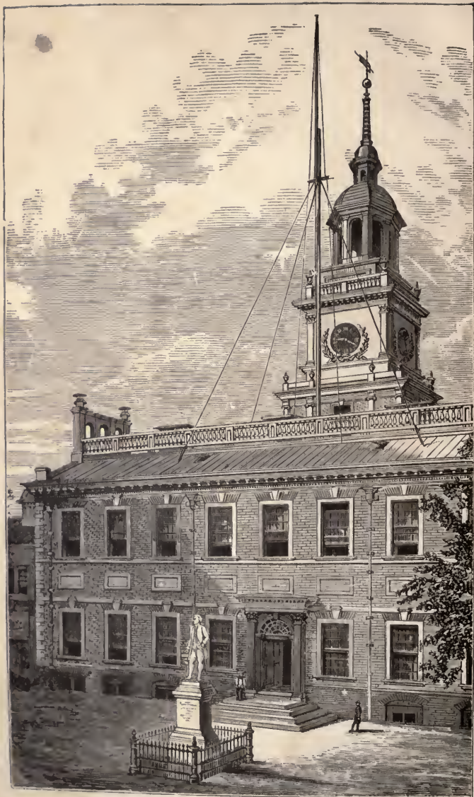
THE COURT HOUSE, PHILADELPHIA.

(In the room to the left on entering the hall the Declaration of Independence was signed.)